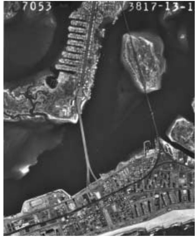
"Special F/X" of Far Rockaway, N.Y.C. Date of Photography: 3-27-84